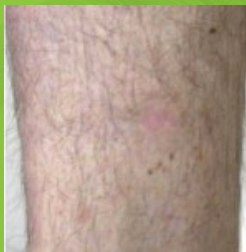
30 DAYS AFTER FINAL TREATMENT