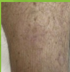
30 DAYS AFTER FINAL TREATMENT